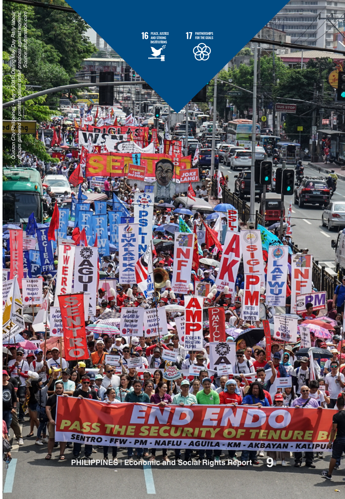
Quezon City/Philippines - May 1, 2019: During May Day Rally labour groups gathered to protest against unfair practices against workers.