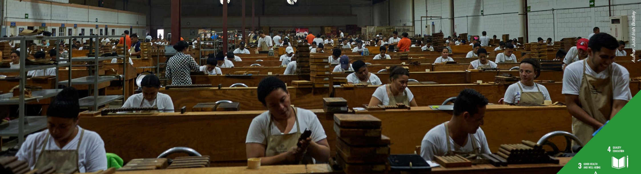
Author: Judd Irish Bradley

comprehensive reform of the Social Security's health, pension and occupational risk systems, the SOLIDAR Network in Honduras reports that the changes produced by the law so far are not very significant, one of the reasons being that the institution responsible for its implementation, namely the Ministry of Labour and Social Security, does not have all the legal and technical resources necessary to carry out its activities. For example, its influence on guaranteeing quality of pensions is limited, and so is its ability to promote prevention actions to reduce the rate of risk of accidents at works, its action being reduced to small interventions related to occupational medicine and its contribution to other benefits such as health, unemployment, maternity or family benefits being almost non-existent.